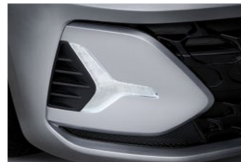
LED Daytime Running Lights (DRL)