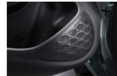
Front / Rear four-speaker system