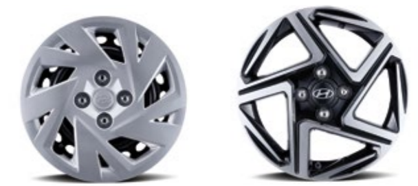
14" Steel wheel cover