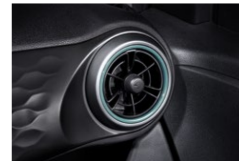
Unique propeller-style AC vents