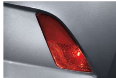
Rear fog lamps