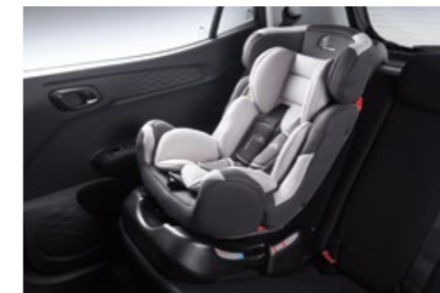
ISOFIX child seat anchor system