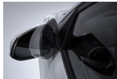
Electric folding mirrors