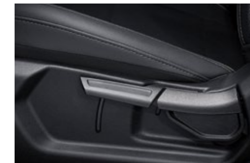
Driver seat height adjuster