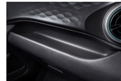
Practical storage area