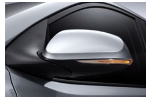
Outside mirrors & repeaters