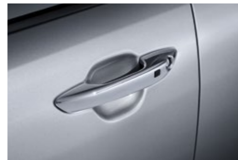
Chrome-coated door handles