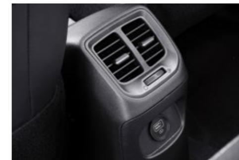
Rear AC vents