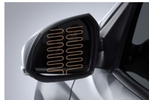
Heated side mirrors