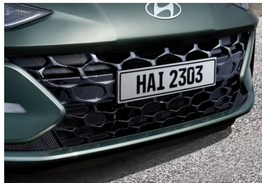
Glossy black radiator grille