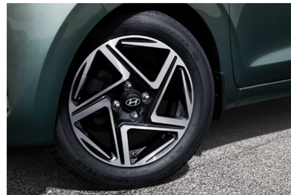
15" alloy wheels