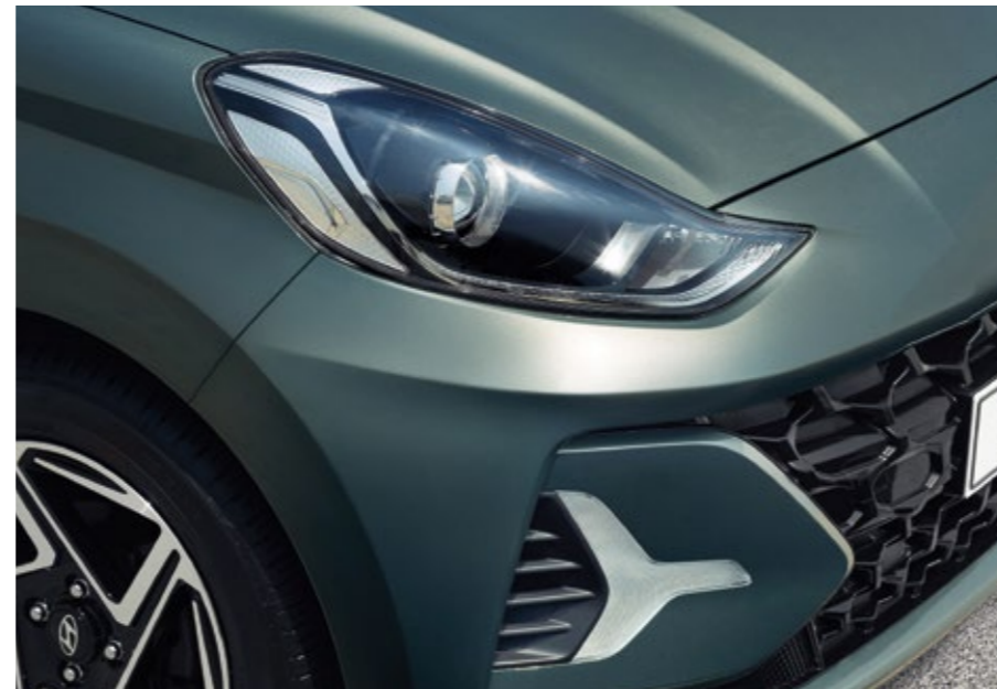
Projection headlamps / LED Daytime Running Lights (DRL)