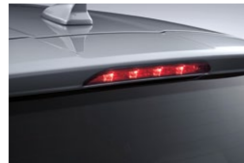
LED high-mounted stop lamp