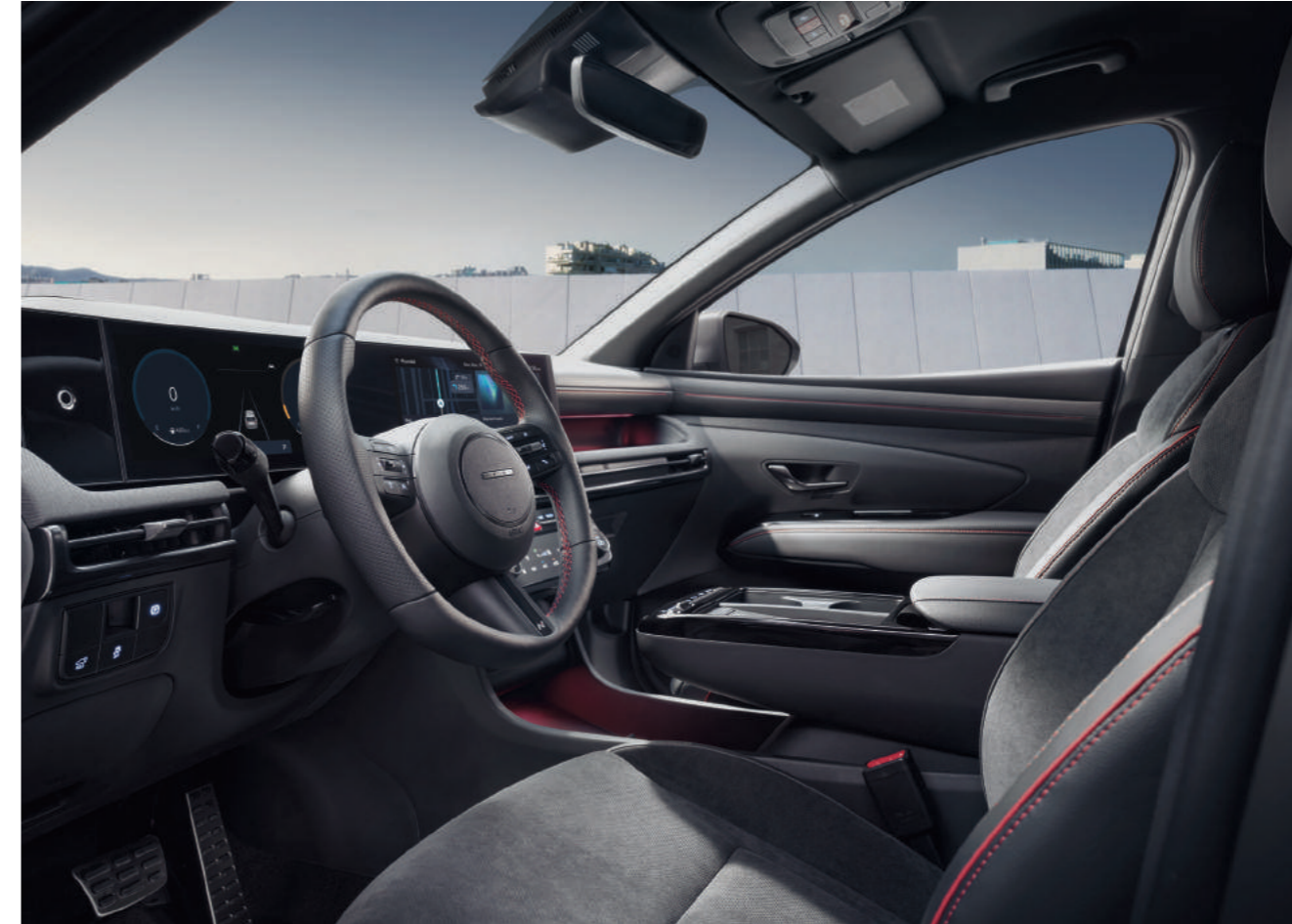
N Line-Exclusive Interior (N Line Emblem Steering Wheel / Red Stitching)