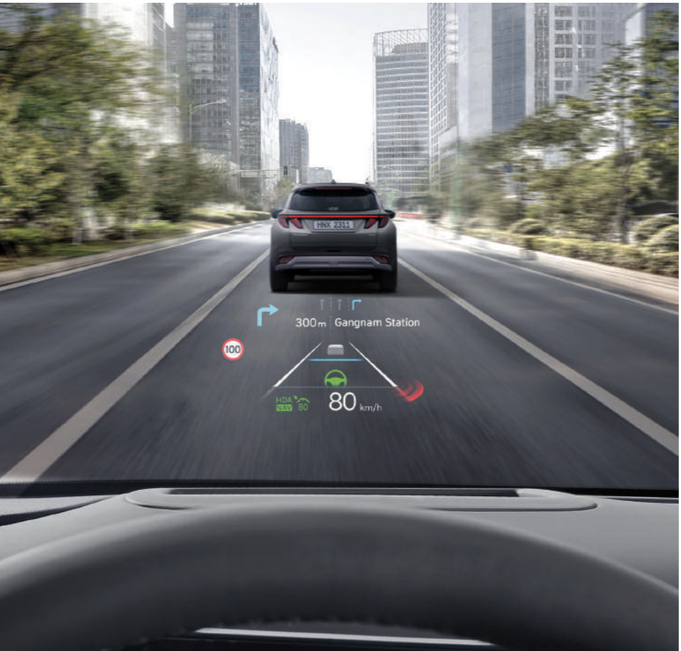
12-inch Head-up Display (HUD)