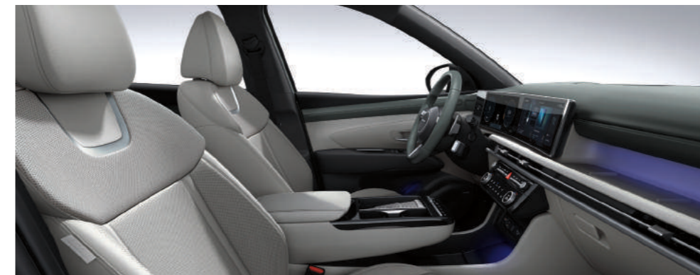
Green three-tone leather