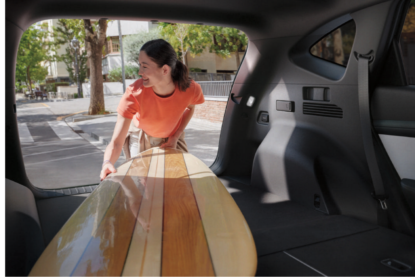
Folding Seats / Remote Folding System