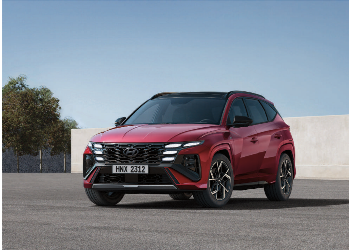
N Line Exclusive Radiator Grille

Packaged with an exclusive design, the new TUCSON N Line awaits those who desire that extra touch of sportiness.