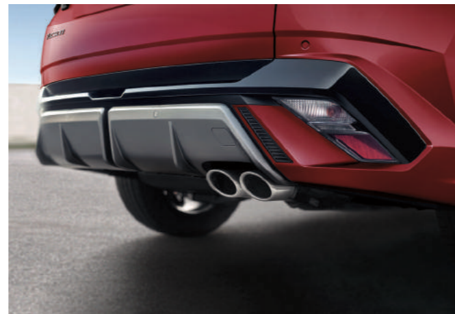
N Line-Exclusive 19-inch Alloy Wheels / Body-color Cladding N Line-Exclusive Single Twin Tip Muffler