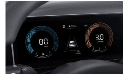
4.2-Inch Color LCD Cluster