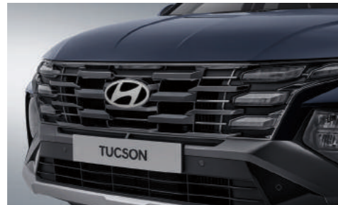
Dark Metal Paint Radiator Grille (Clear Type DRL)