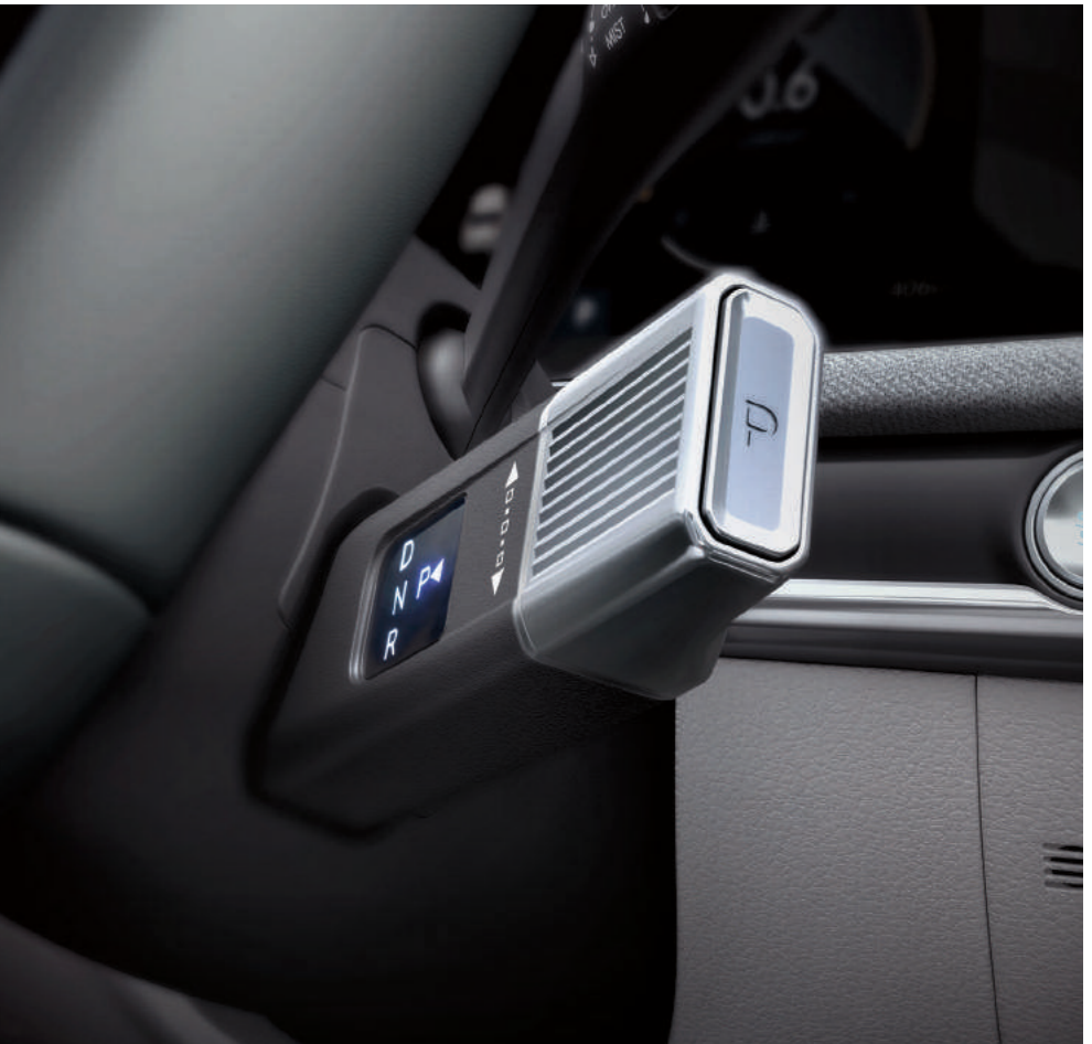
Column-type Shift by Wire (SBW)