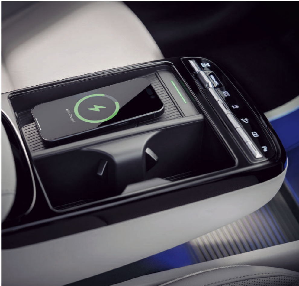
Wireless Power Charger (WPC)