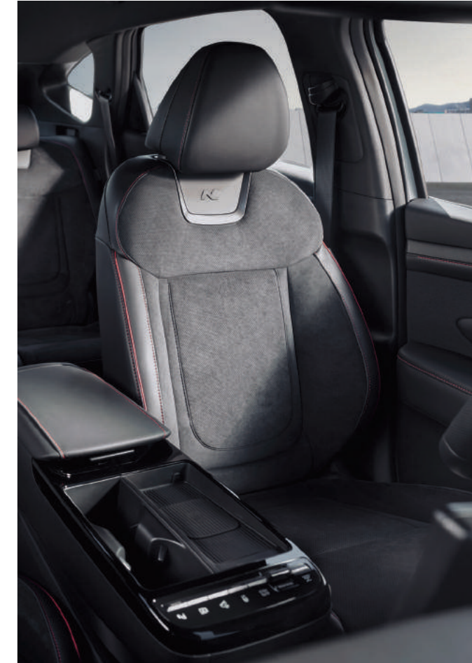
N Line-Exclusive Suede Seats