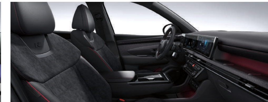
Black monotone suede + leather with red stitching