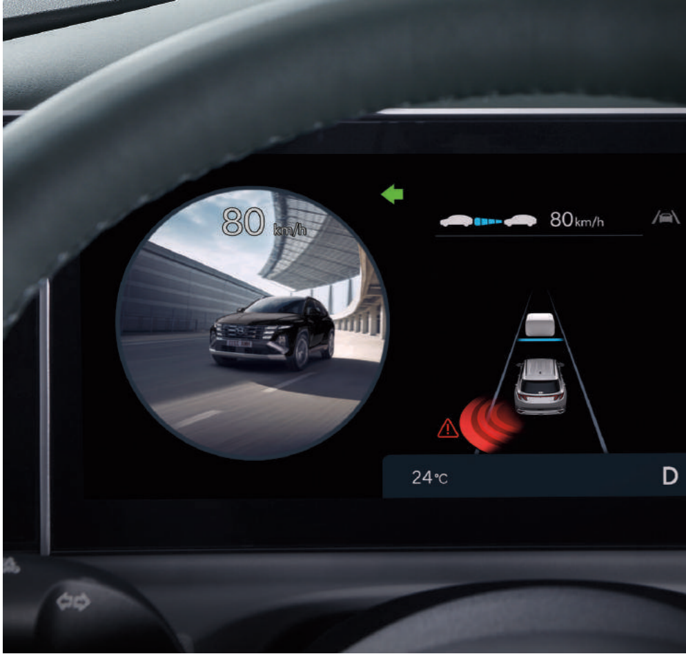
Blind-Spot View Monitor (BVM)

The new TUCSON is packed with reliable features to protect you from the unexpected and ensure you leave no one behind.