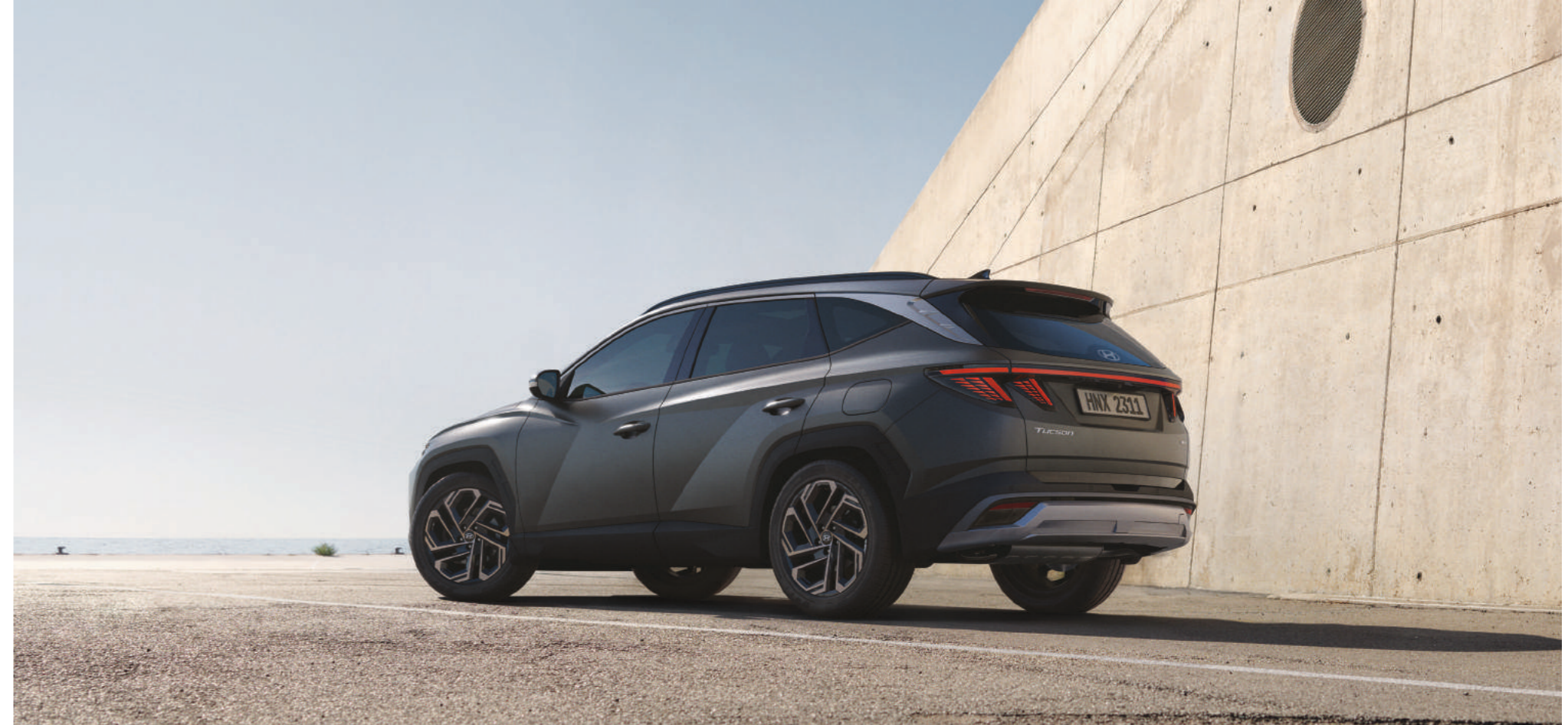
LED Rear Combination Lamps / Rear Bumper / Parametric Jewel Surfaces