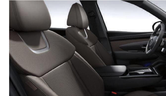
Brown color package leather