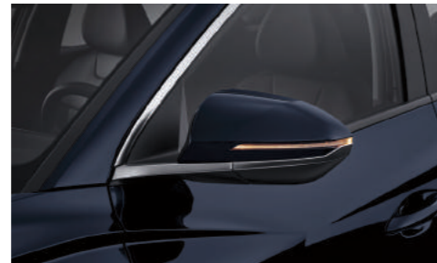
Turn Signal Indicator LED Outside Mirror