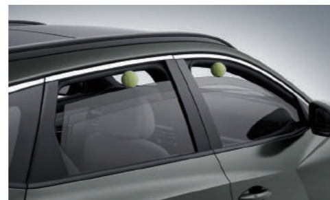
Safety Power Window