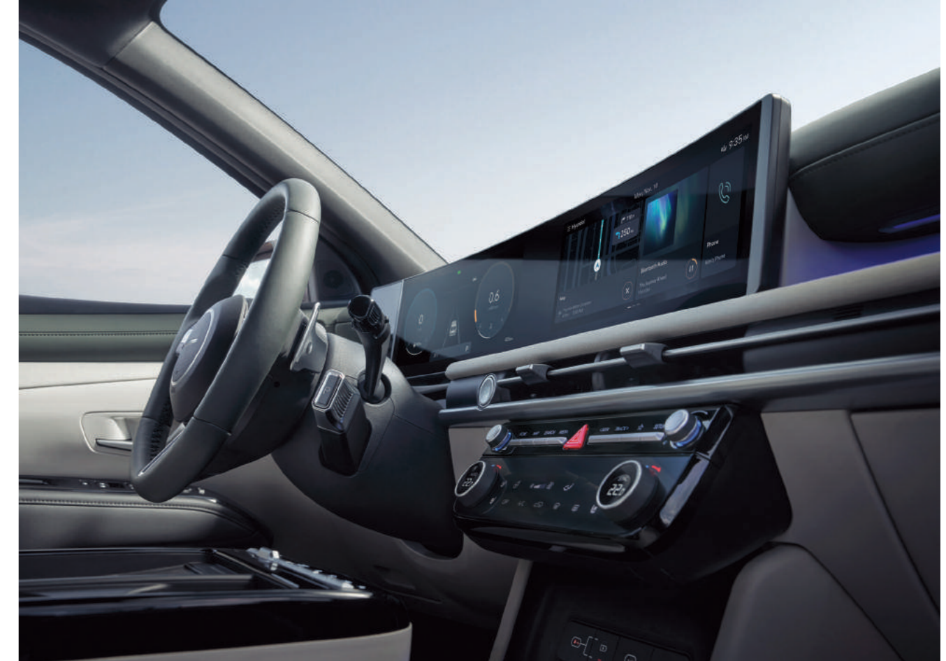
Panoramic Curved Display 12.3-inch (Cluster) + 12.3-inch (AVNT)