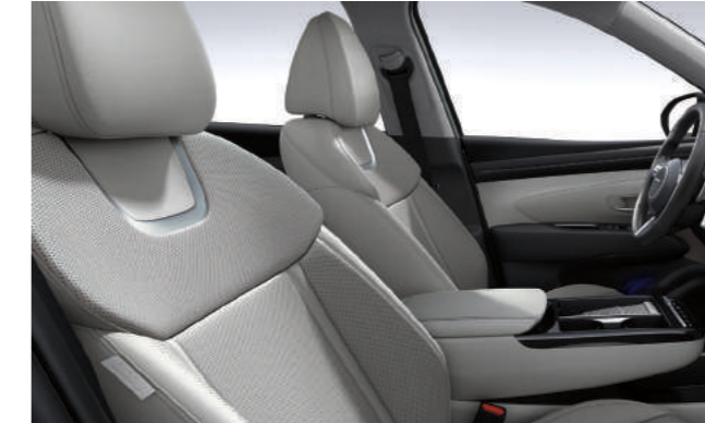
Black gray two-tone leather