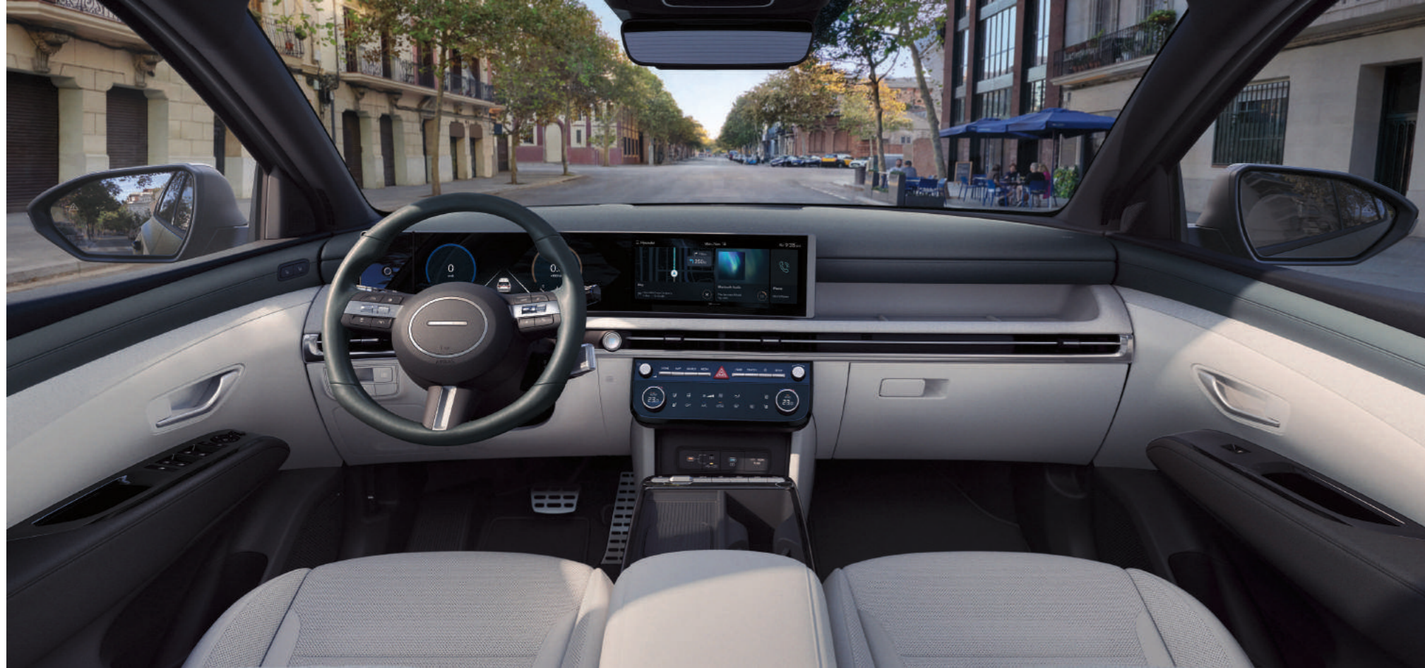
Wrap-Around Architecture Design

The cabin's wide horizontal design wraps around the interior, enveloping the passengers with a seamless architecture that integrates technology and style.