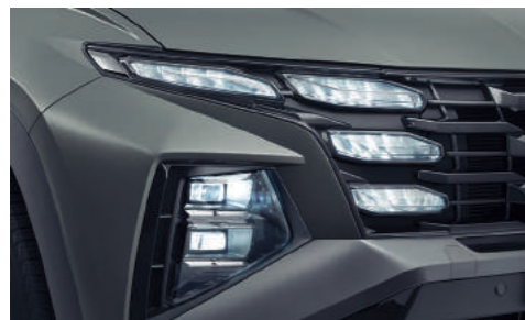
Full LED Headlamps (Wide Projection with IFS Function)