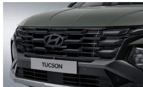
Dark Tinted Chrome Radiator Grille (Hidden Lighting DRL)