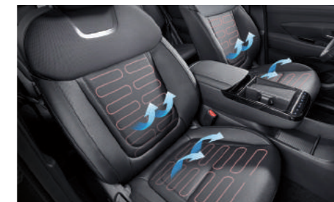
Front Heated and Ventilated Seats