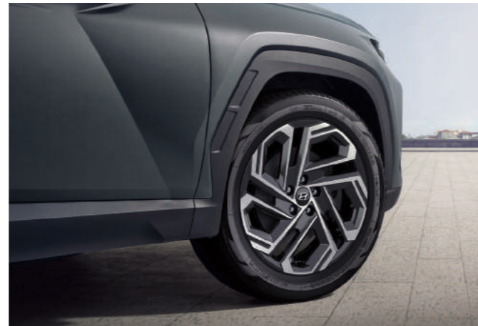
Roof Rail / Panoramic Sunroof 19-inch Alloy Wheels