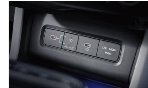
USB-C Data/Charging Ports