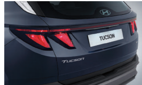
Rear Combination Lamps (Bulb Type)