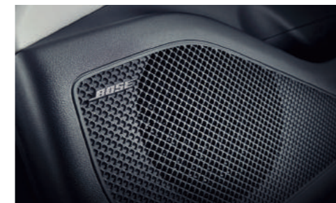
BOSE Premium Sound System