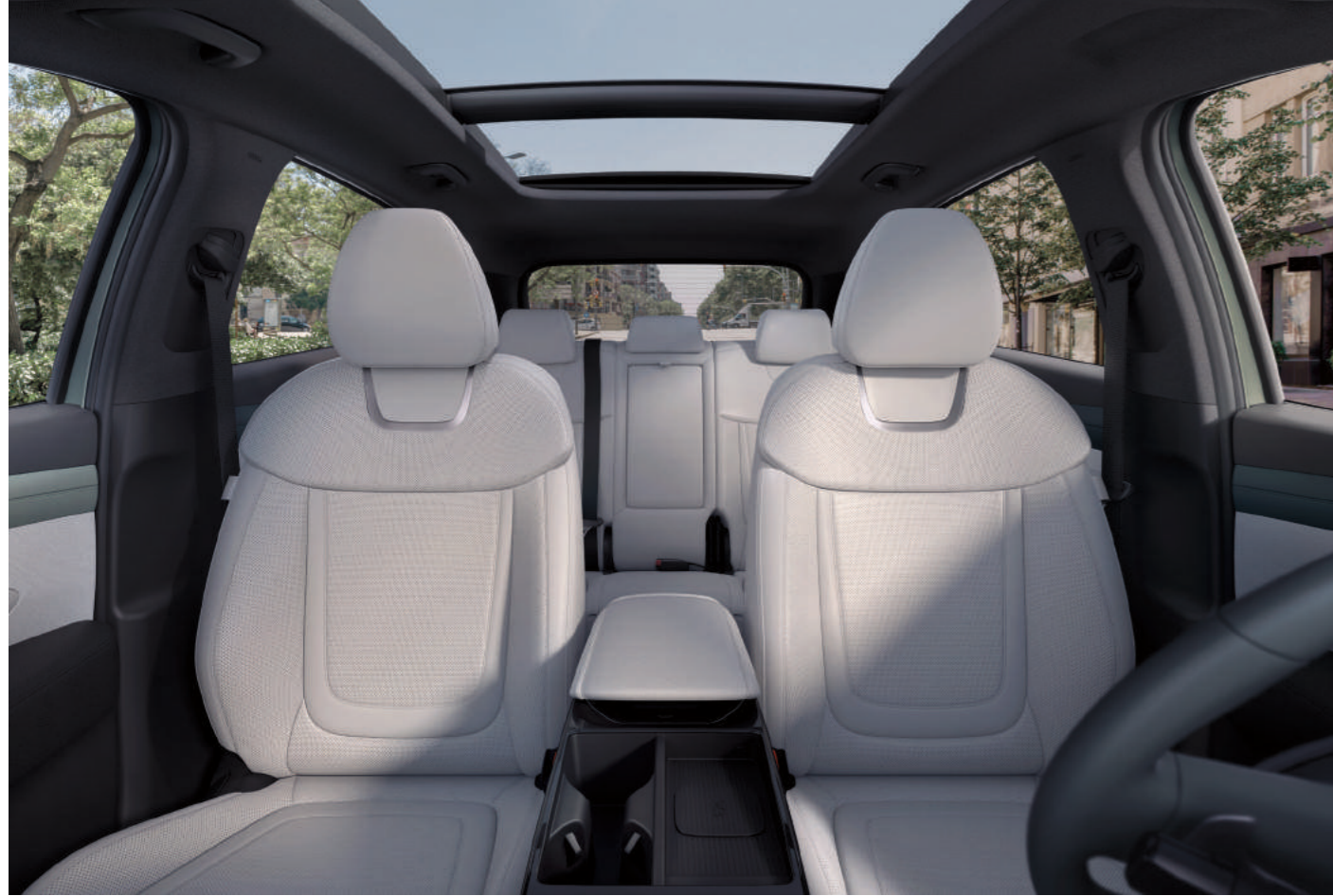
1st & 2nd Row Seat

Make room for more. Its best-in-class cargo space and roomy interior support various lifestyles and activities, offering more versatility than ever.