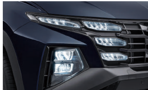
Full LED Headlamps (MFR Type)