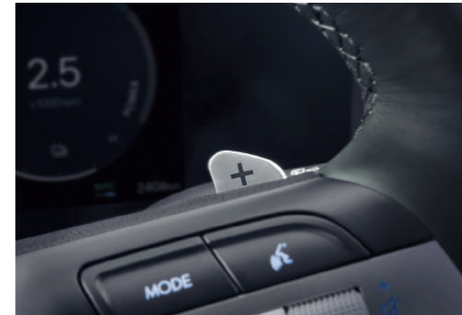
Hybrid Exclusive Features Paddle Shifter-Regenerative Braking Mode