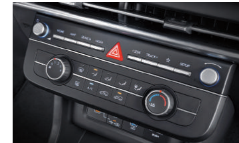
Manual Air Conditioning