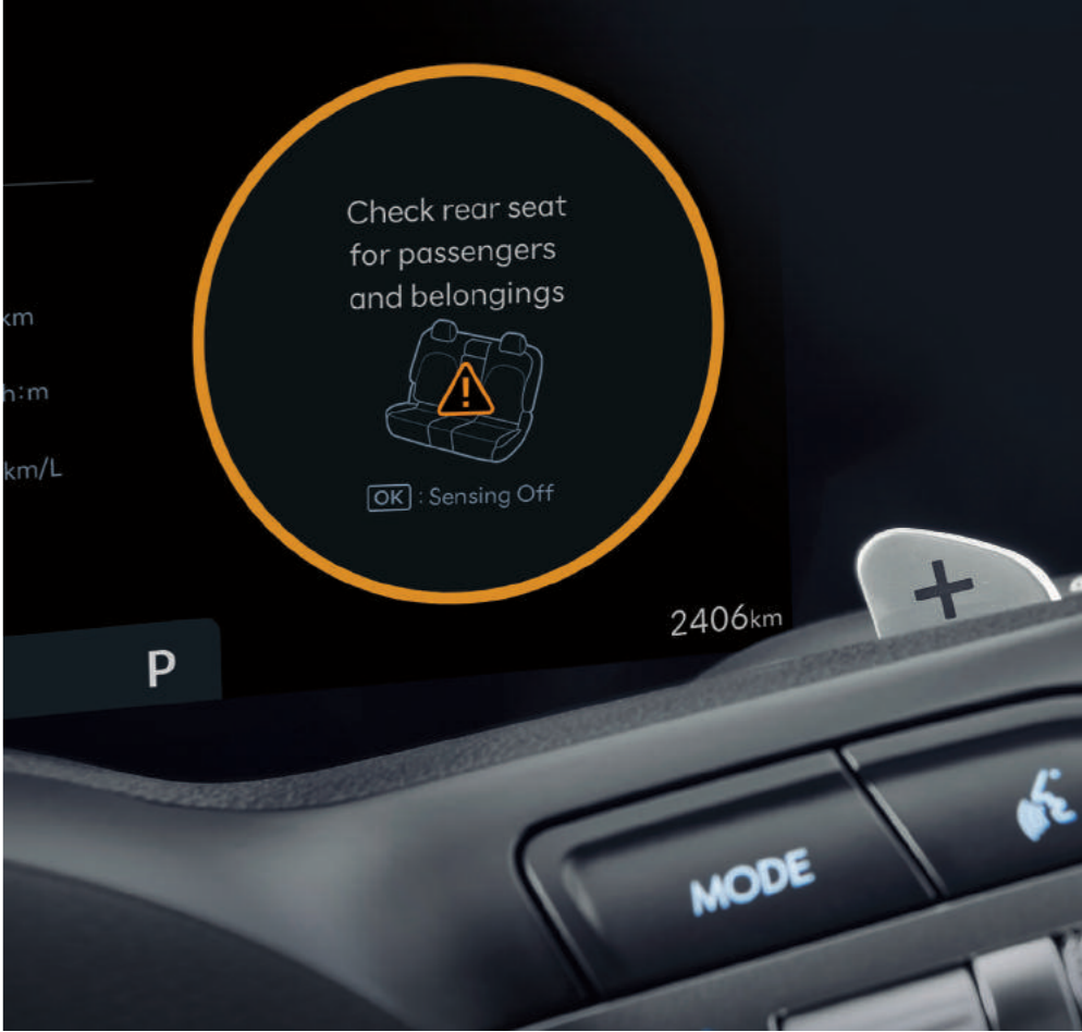
Rear Occupant Alert (ROA)