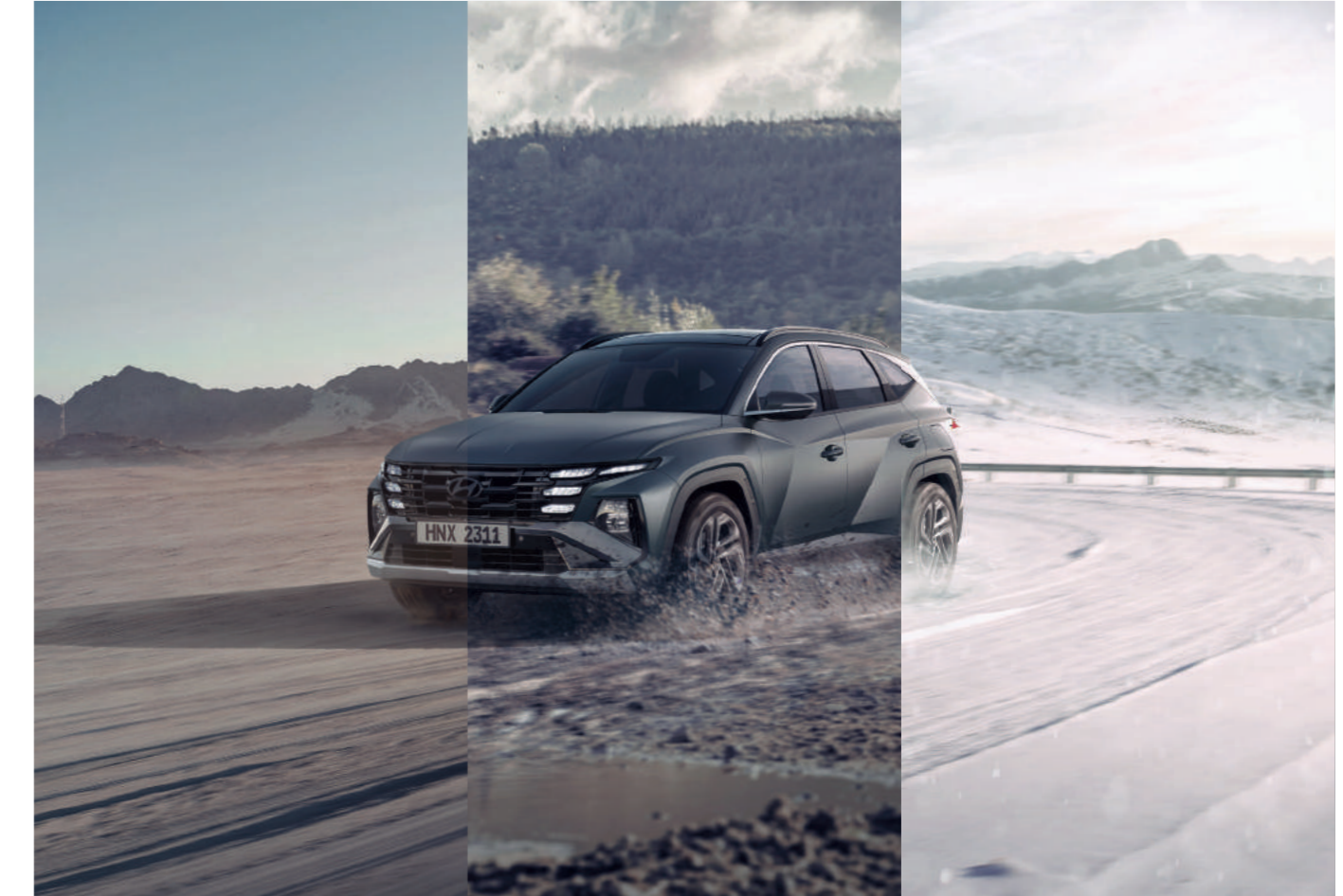
4WD HTRAC / Terrain Mode (Sand, Mud, Snow)

TUCSON AWD provides optimal driving performance through actively distributing driving force to the front and rear wheels according to various driving situations.