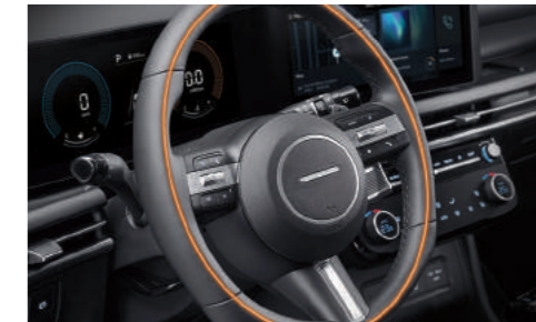
Heated Steering Wheel